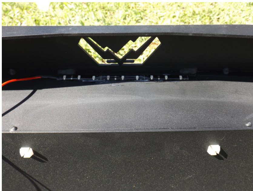
Figure 5 – LED Strip Location

Application: 10-14 Ford Raptor 2009-2014 F150