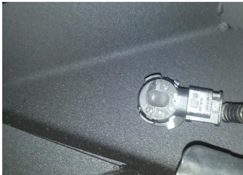
Figure 6a (inner passenger side: plug toward center of bumper)