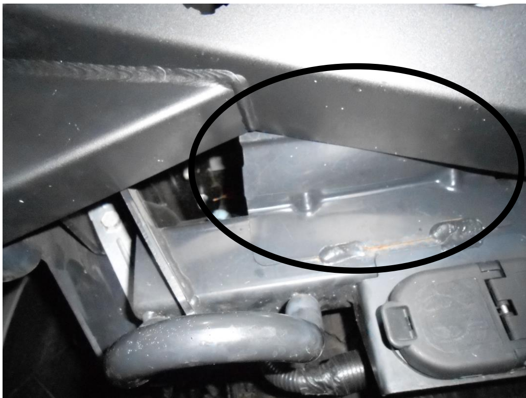
Figure 3 (image of bumper and hitch installed)

Application: 10-14 Ford Raptor 2009-2014 F150