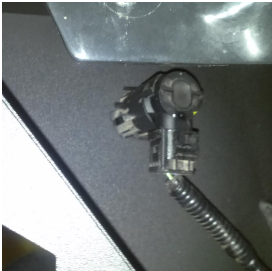
Figure 6b (outer passenger side: plug toward ground)

Application: 10-14 Ford Raptor 2009-2014 F150