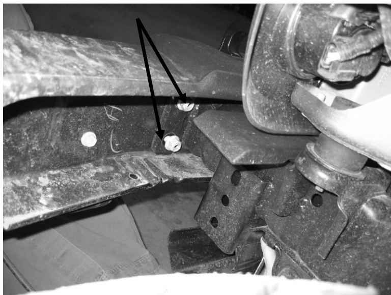
Figure 1: Back side of bumper

■ E) Slide bumper forward slightly so that the studs still pass through frame but the bumper rocks forward. Remove fog harness retainer clips from bumper.