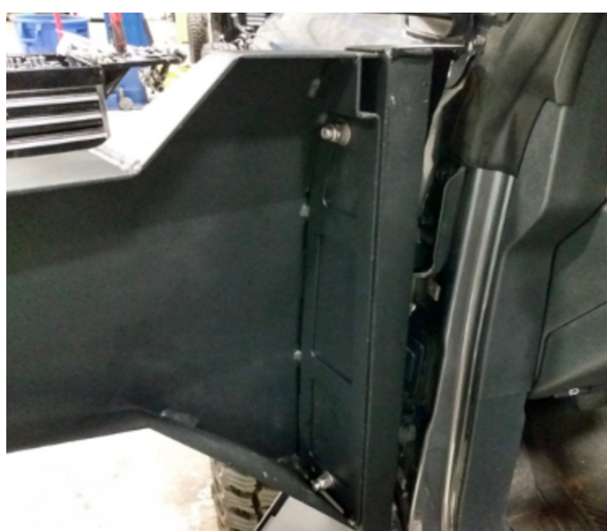
Figure 1 Figure 2